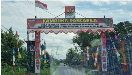
Figure 3. Pancasila village in North Luwu

Likewise, in traditional and religious events, Muslims who grow as the majority adherents receive support from other adherents, and run very well. Religious activities such as Eid al-Fitr and Eid al-Adha which utilize large areas in the field also receive support from all components. This spirit of togetherness was then embodied by one of the villages in North Luwu by declaring "Kampung Pancasila" as a miniature plural society but living in an atmosphere of harmony, peace and mutual respect.